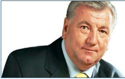
LEONID BUJOR MINISTER OF EDUCATION OF THE REPUBLIC OF MOLDOVA

The example of kindergarten from Peciste village, Rezina, inaugurated at the beginning of this year by Ministry of Education, has revealed an important thing concerning our joined efforts oriented towards renovation and endowment of kindergartens under the „Education for All – Fast Track Initiative” Project.