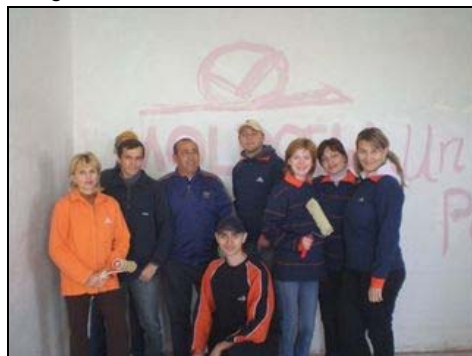
Activity „Let’s show we care!” Town of Basarabasca, 2007

Company participated in accomplishing renovation works in kindergartens from Basarabasca and Anenii Noi raions.