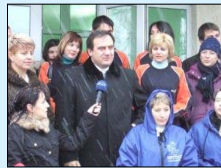
Activities „The whole village is helping me become a Great Personality!”: Basarabasca (2007), Panasesti, Straseni (2009), and Calfa, Anenii Noi (2007)